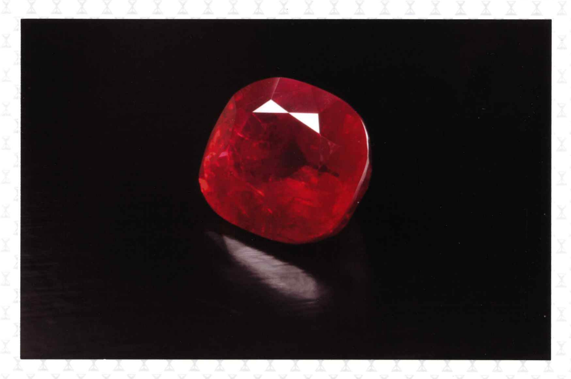
The 25.59 ct 'Sunrise Ruby'

The high esteem with which it has long been held in the East is perfectly expressed by two of its names in Sanskrit: 'Ratnaraj', 'king of the precious stones' and 'Ratnanayaka', 'leader of precious stones'. The outstanding colour of ruby is attributable to the introduction of chromium oxide, which found its way into the corundum structure an infinite number of years ago and replaced a small percentage of alumina.